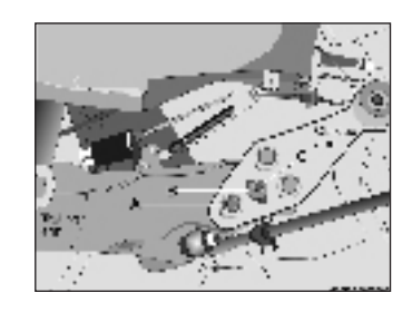
The essential information for setting up rear camber and toe. 44 Alignment, Wheels, Tires